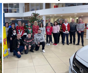
Vertu Honda Newcastle