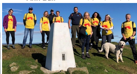
LBG Team North East