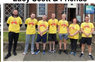
Hebburn Martial Arts